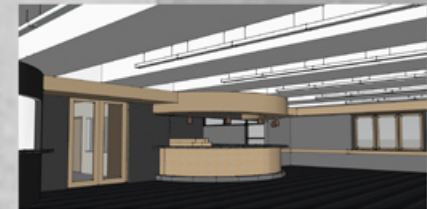
VIEW OF BAR FROM BANQUET HALL