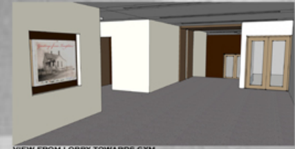
VIEW FROM LOBBY TOWARDS GYM